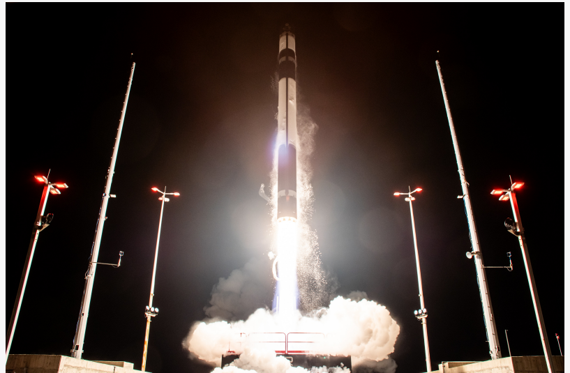
A Mola CubeSat from the Naval Postgraduate School (NPS) was successfully launched into orbit on March 21 by the National Reconnaissance Office aboard a Rocket Lab Electron rocket launched from Wallops Island, Va.