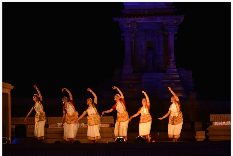
Khajuraho Dance Festival