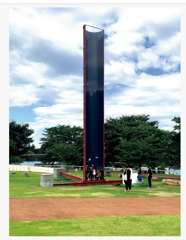
GOLDWIN PLAY EARTH PARK TOYAMA "Wind Playground Equipment"

All applications are required to be submitted through a designated website.