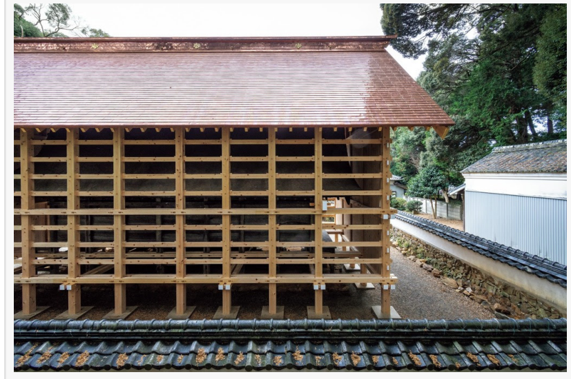
Hoshino Shrine Covered Main Shrine Designated cultural property of Toyokawa City, Aichi Prefecture)

Application Website: <a href="https://kukan.design/">https://kukan.design/</a>