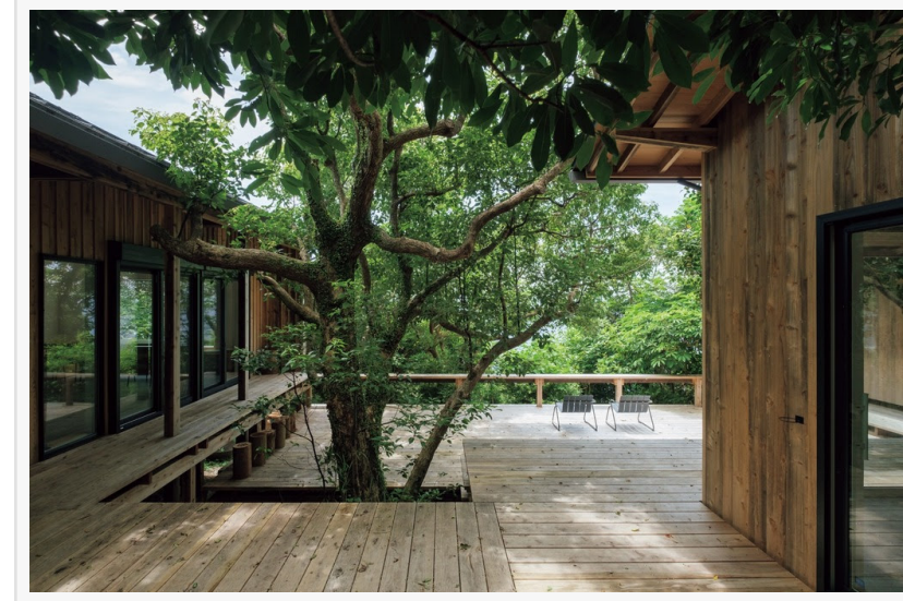
Sumu Yakushima Regenerative Life Studio

*Works that have been realized between March 1, 2023 and April 30, 2024 will be eligible.