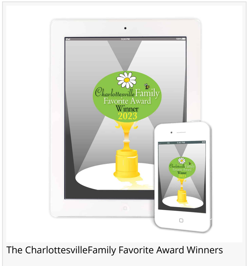
The CharlottesvilleFamily Favorite Award Winners