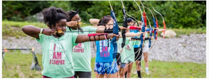
Kids doing archery at summer camp near Charlottesville, VA

This press release can be viewed online at: https://www.einpresswire.com/article/699531190