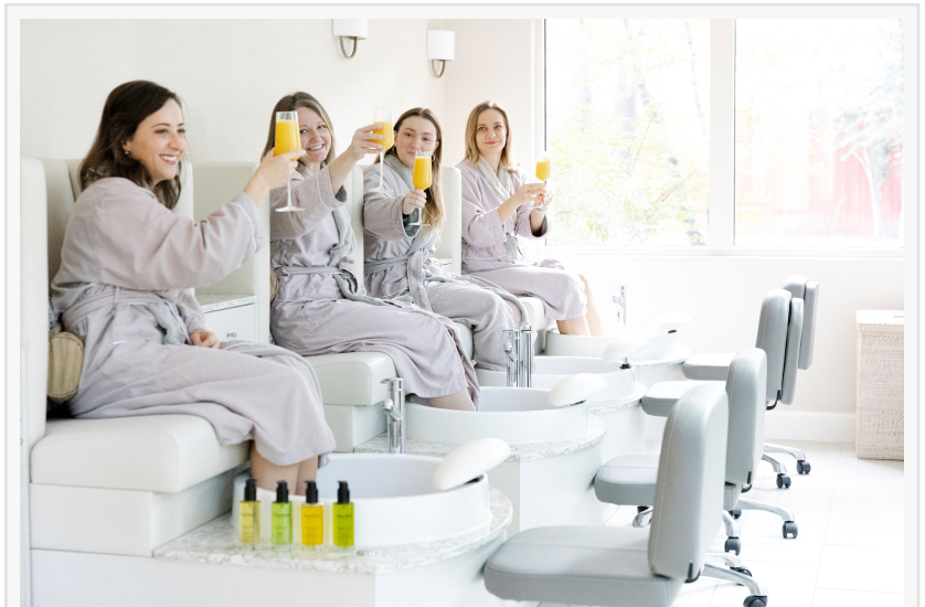
Trellis Spa, the largest luxury spa in Texas is the perfect place to enjoy treatments with bridesmaids prior to wedding festivities.

HOUSTON, TEXAS, USA, May 14, 2024 /EINPresswire.com/ -- In addition to being one of Houston’s top luxury wedding destinations, The Houstonian Hotel, Club & Spa is now offering couples, their bridal parties, and guests on-site Wedding Wellness packages dedicated to health, beauty, deep relaxation, and recovery at Trellis Spa and The Covery by the Houstonian.