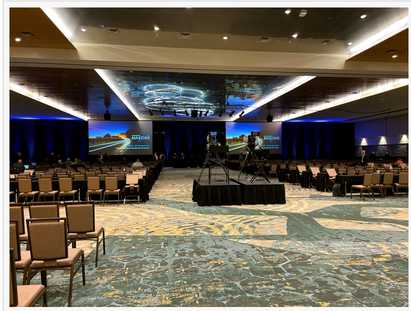
The ProMedia Group of Tampa Corp at Crestron Masters Event 2024 in Orlando

The Crestron Masters Event serves not only as a platform for individual recognition but also as a catalyst for advancing the collective expertise of organizations. By ensuring that its engineering and programming departments maintain Master level proficiency, The ProMedia Group of Tampa remains at the forefront of innovation, delivering solutions that are not only technologically advanced but also cost efficient due to quality designs and forethought. This