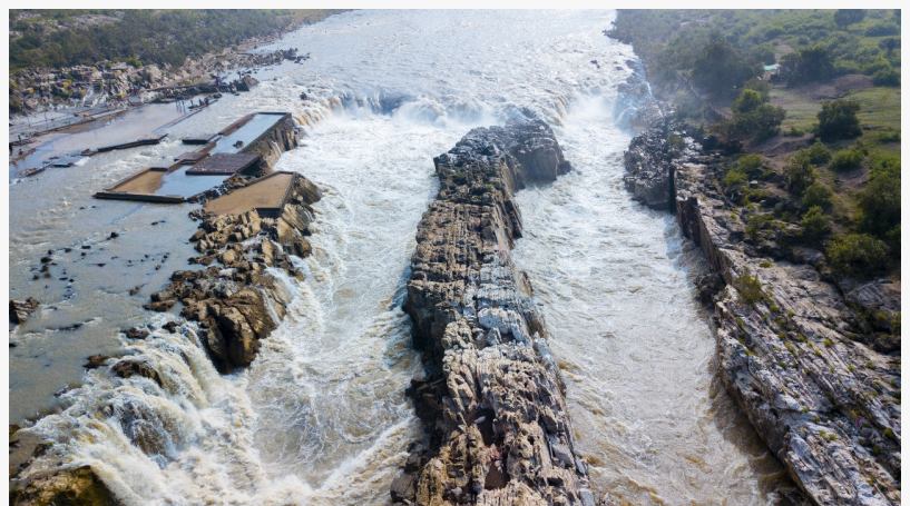
Narmada River Tributaries

Two major rivers, Narmada and Tapti flow across the State towards the Arabian Sea. Major tributaries like the Chambal, Betwa, Ken, Sindh, Wainganga, and Warda keep Madhya Pradesh green and scenic. Bhopal, the capital of Madhya Pradesh is known as 'The city of lakes.' Constructed in the 11th century, the major lakes in the city were called 'Bhojtal', this is how the city of Bhopal got its name. The MP Tourism Boat Club in the upper lake which is 31.5kms long and known as one of the oldest manmade lakes in India offers serene boating experiences with paddle boats, motor boats, and small cruise boats as well as equipment for kayaking, canoeing, parasailing and other water sports. Facilities like this are available in many other locations in the state where waterbodies are located like Bargi in Jabalpur, Tigma Dam in Choral Reservoir, Sakhya Sagar Lake in Shivpuri, and