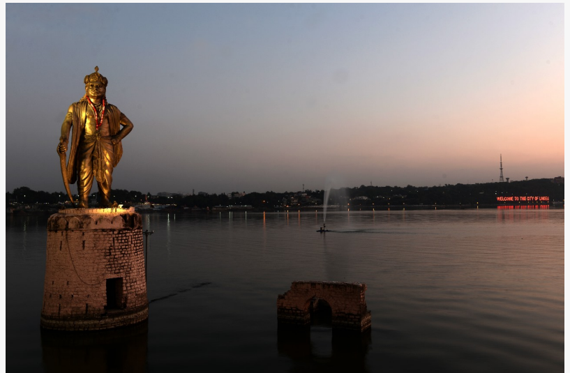
Raja Bhoj Statue - Bhopal Lake