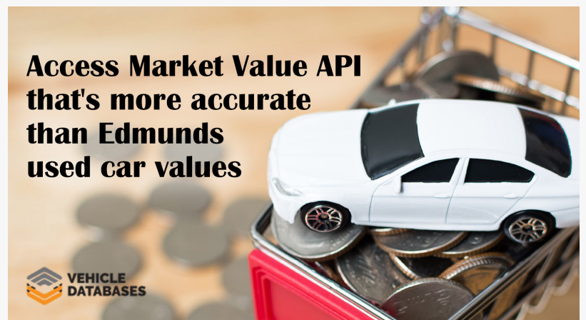
Market Value API