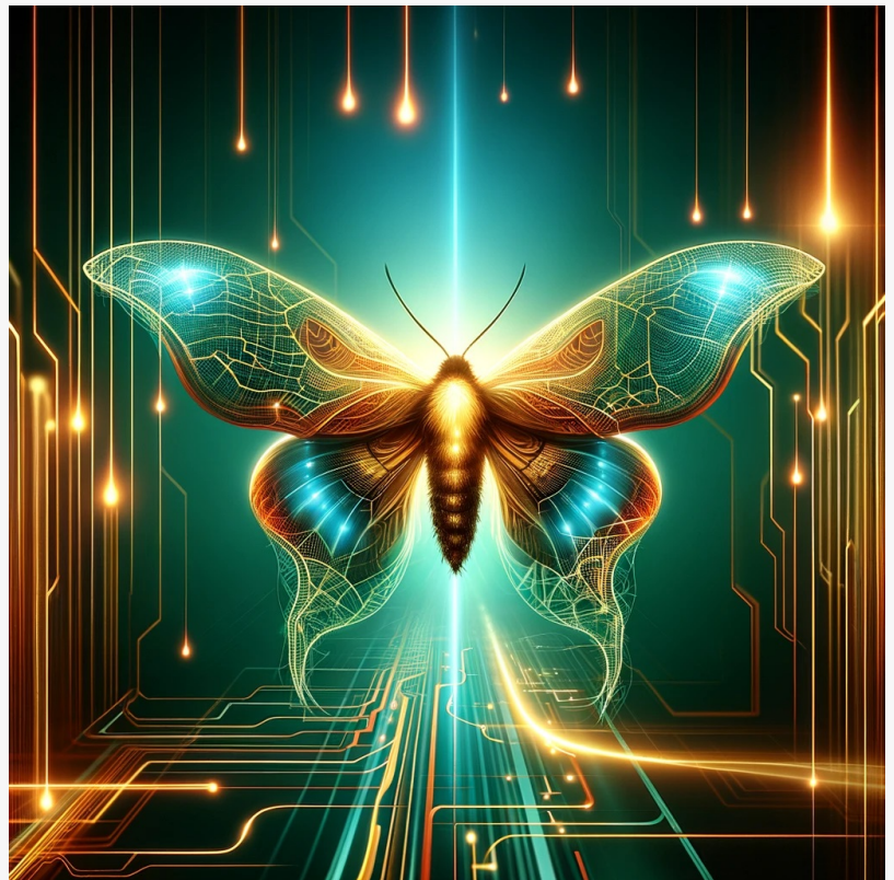
Futuristic silk moth, the symbol of Bifin AI