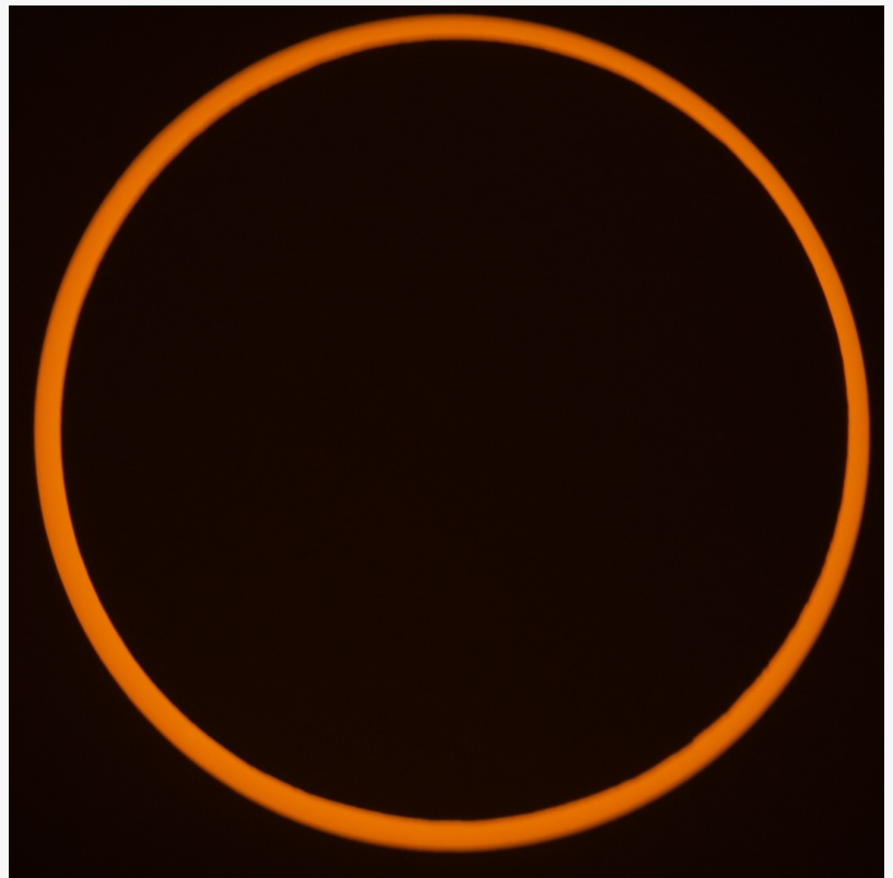
Diamond ring eclipse