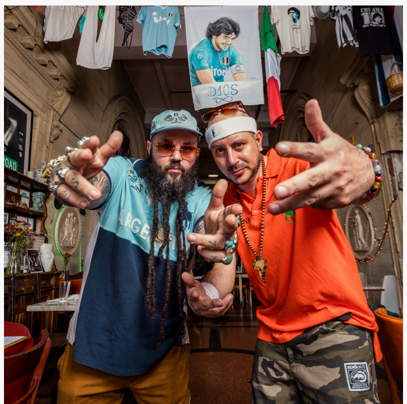
Los Chicos Criollos