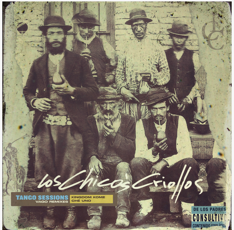
Tango Sessions Cover