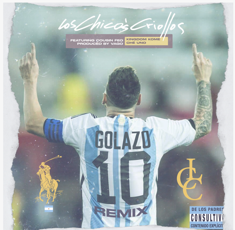
Golazo cover art