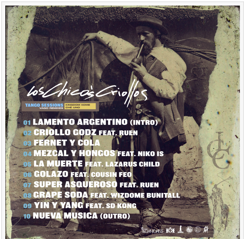
Tango Sessions Back and Tracklisting