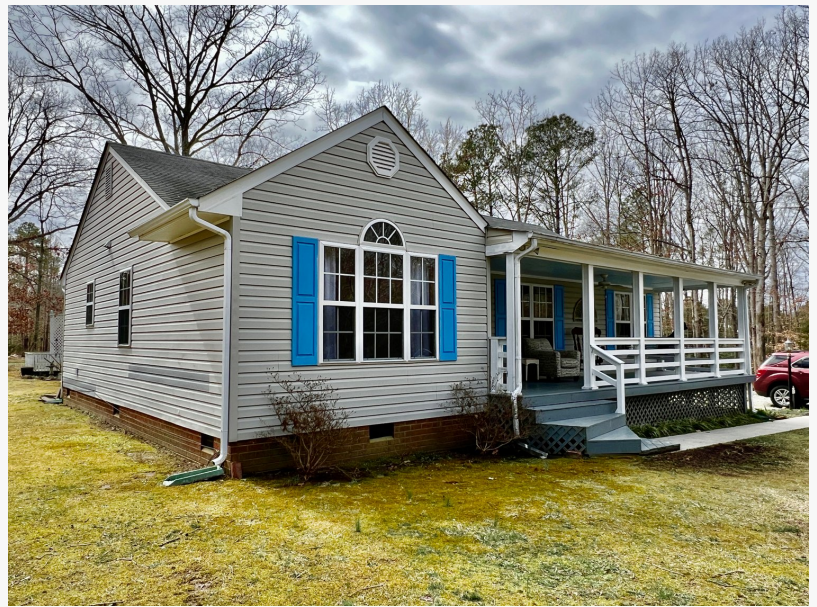
2889 Quaker Rd., Quinton, VA 23141