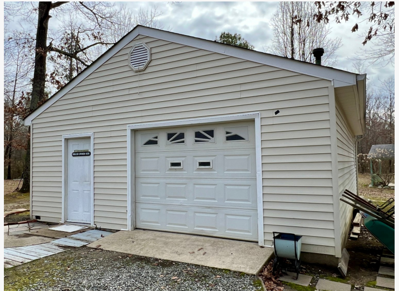
2889 Quaker Rd., Quinton, VA 23141