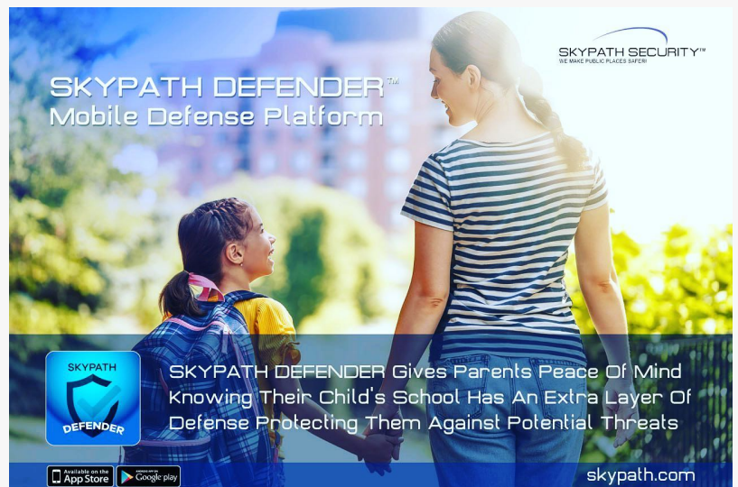
Giving parents piece of mind knowing the children are protected in school