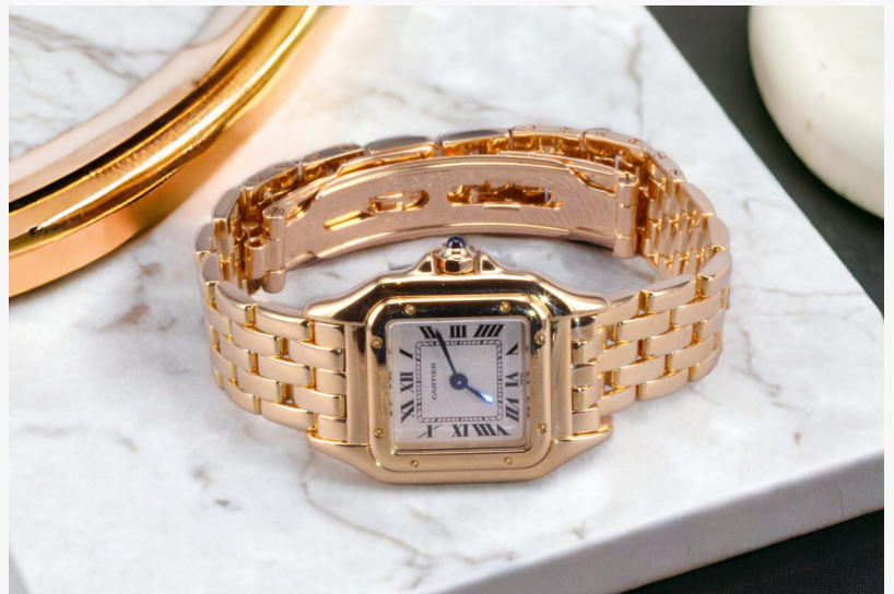
An 18k Gold Panthère de Cartier Watch Bought by C. Blackburn Jewelers