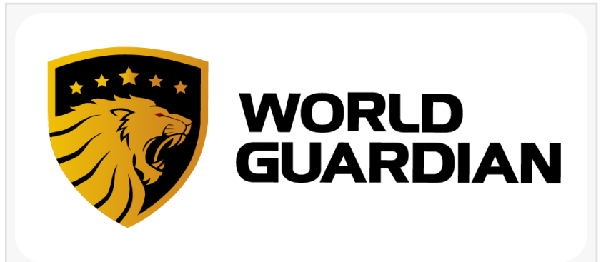
World Guardian Security Services Logo

World Guardian's cybersecurity services will encompass a range of proactive measures to