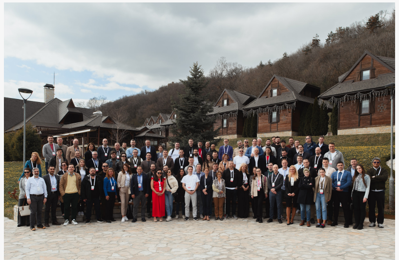
Katapult residency week group photo

This press release can be viewed online at: https://www.einpresswire.com/article/700017350 EIN Presswire's priority is source transparency. We do not allow opaque clients, and our editors try to be careful about weeding out false and misleading content. As a user, if you see something we have missed, please do bring it to our attention. Your help is welcome. EIN Presswire, Everyone's Internet News Presswire™, tries to define some of the boundaries that are reasonable in today's world. Please see our Editorial Guidelines for more information. © 1995-2024 Newsmatics Inc. All Right Reserved.