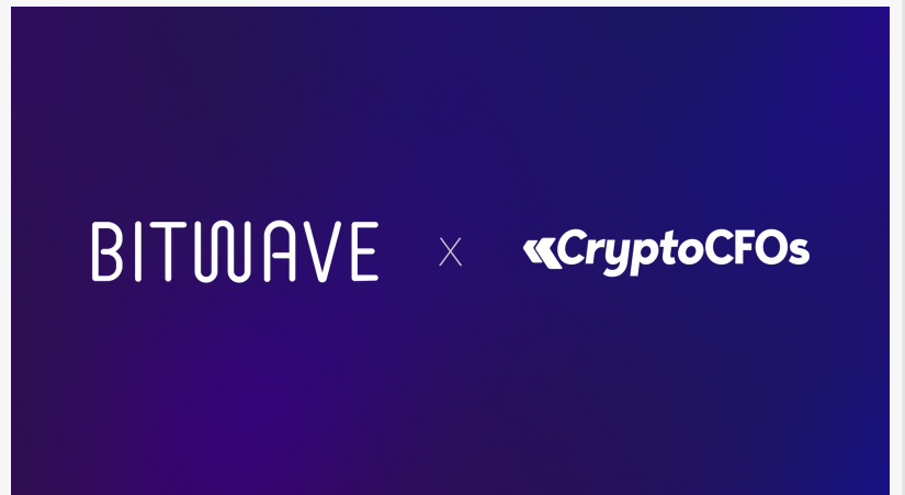
Bitwave and CryptoCFOs Unite: Elevating the Future of Enterprise Digital Asset Finance

/EINPresswire.com/ -- In a groundbreaking collaboration, CryptoCFOs , the leading community of tax and accounting professionals in Web3, proudly announces its strategic partnership with Bitwave , the top digital asset finance platform for enterprises. This alliance marks a significant step forward in providing Web3 finance professionals with Bitwave's enterprise-grade digital asset management suite, professional education community, and on-demand expert guidance.