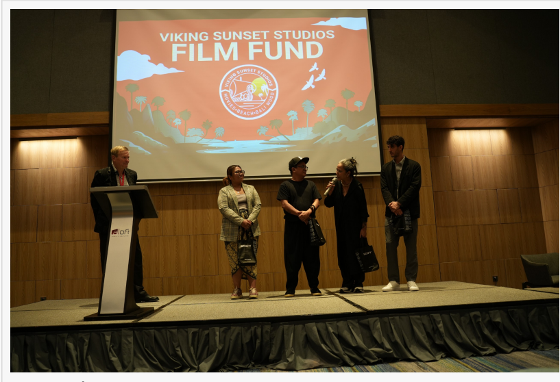
VSS judges announcing winners