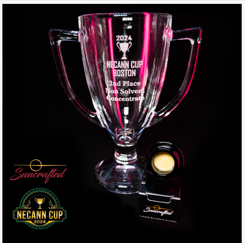
Lemon Sweet x Cherry Pie OG Live Rosin from Suncrafted took 2nd place in the solventless concentrate category at NECANN 2024.

NECANN, now in its 10th year at the Hynes Convention Center in downtown Boston, has become the mecca for cannabis brands doing business on the east coast. Companies from around the region and nation gather to highlight new products and services, and many regarded cannabis industry commentators speak their minds in sessions and seminars, for the cannabis industry each year in late March.