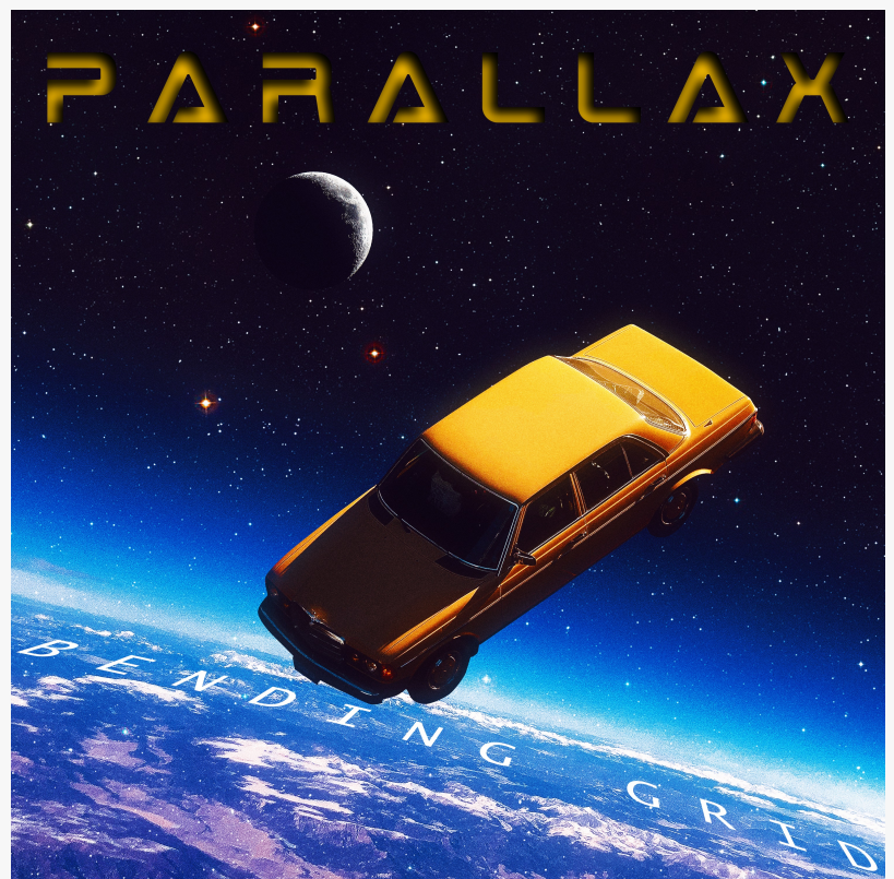
Album Artwork for Bending Grid's PARALLAX album

The Safety Word's involvement in two original songs on "Parallax," "Aeons End" and "The Universe Within," adds a unique dimension to the album. "Aeons End" is a powerful anthem