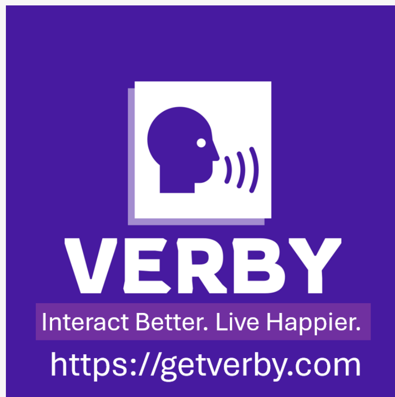
Getverby.com launches Verby, an AI coach for entrepreneurs and small business owners