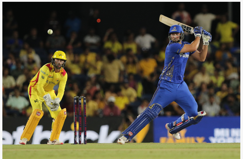
MLC's World Class Action Returns This Summer