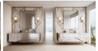
Close Design Interiors