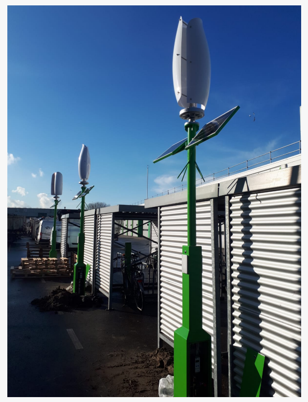
Wind and Solar E-bike Charging Poles

- A winner of the 2023 Yes San Francisco clean technology competition for top technologies to implement in San Francisco