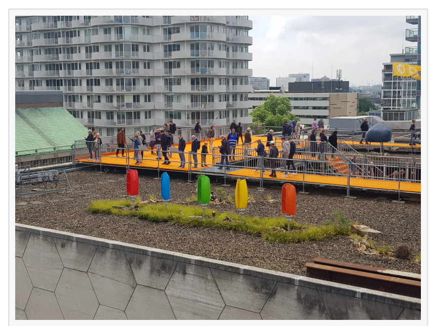
Flower Turbines at Rotterdam Roof Days