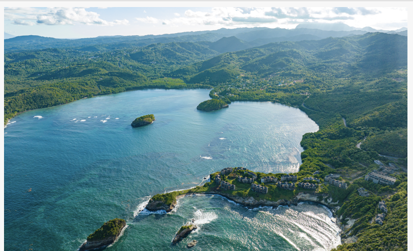
Aerial of Anticipated 1881 Golf and Ocean Club

MIAMI, FLORIDA, USA, April 2, 2024 /EINPresswire.com/ -- 1881 Holdings Inc, is under contract and scheduled to close this Summer on 600-acres of oceanfront property on Praslin Bay, St. Lucia.