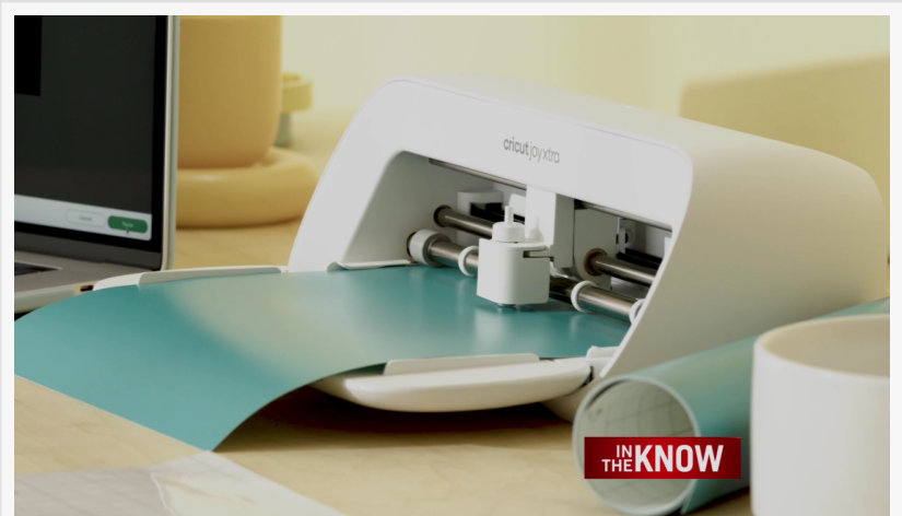
Cricut Joy Xtra