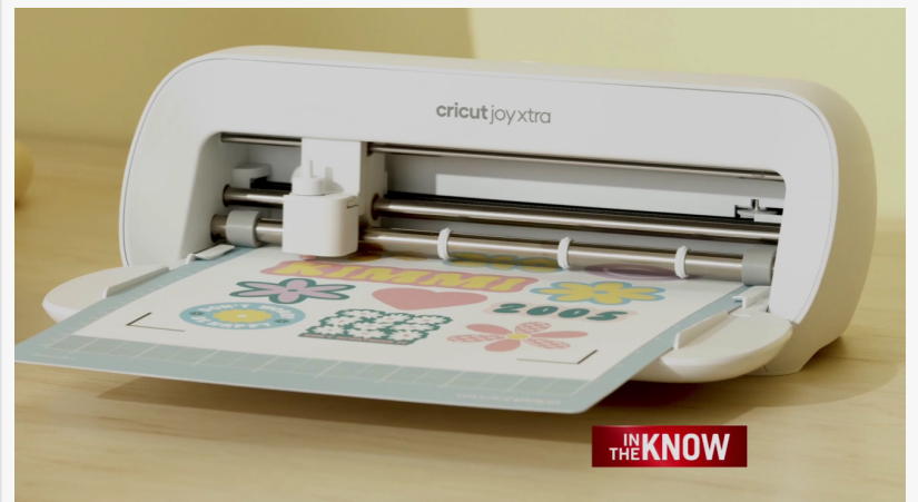
Cricut Joy Xtra