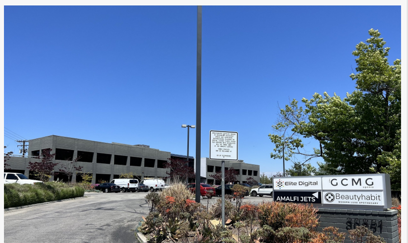
Amalfi Jets HQ in Agoura Hills

This press release can be viewed online at: https://www.einpresswire.com/article/700613833