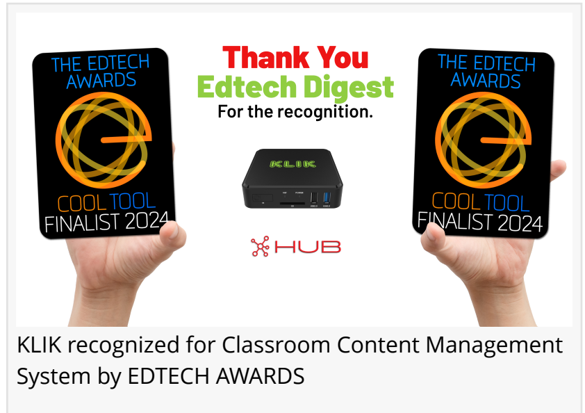
KLIK recognized for Classroom Content Management System by EDTECH AWARDS