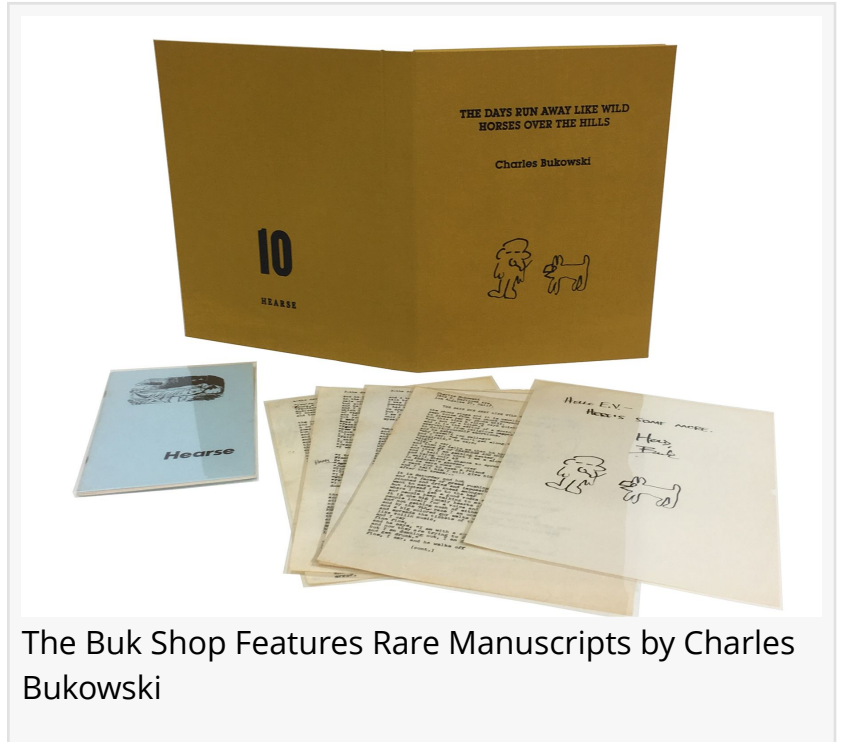
The Buk Shop Features Rare Manuscripts by Charles Bukowski