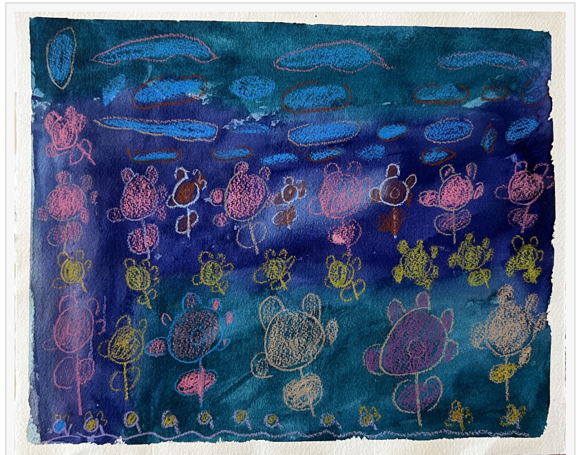
Work from 'Beyond the Surface', co-presented by the West Town Chamber of Commerce and Esperanza Art Studio, on view beginning April 5th through April 24th.

( www.esperanzacommunity.org ). The exhibition, a group show of works that confront the assumptions associated with people with intellectual disabilities, will be on view at the West Town Chamber of Commerce beginning April 5th through April 24th. Through the 'Beyond the Surface' show, Esperanza artists reclaim their identity to dismantle any preconceived notions of who they are. Individuality permeates their work as each artist fills their canvas with unique imagery and color, a reflection of them. These pieces allow spectators to get a grasp of their artists beyond what is seen on the surface.