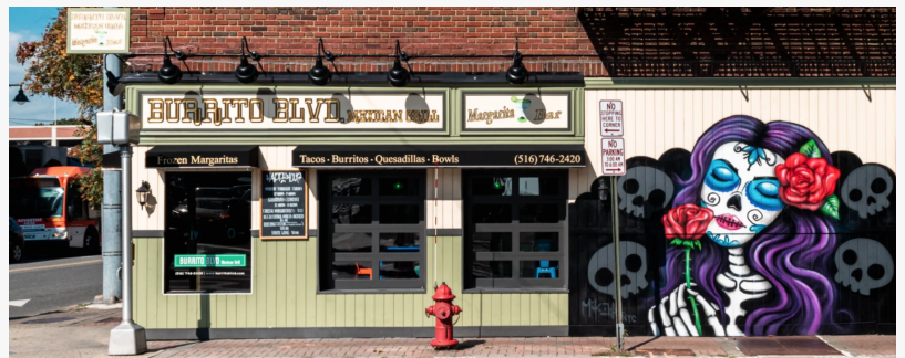
Mineola Location - Burrito BLVD

MINEOLA, NEW YORK, UNITED STATES, April 3, 2024 /EINPresswire.com/ -- Long Island-based, fast-casual, street-style Mexican restaurant concept, BURRITO BLVD Mexican Grill, with four locations in Queens (Middle Village), Nassau and Suffolk counties (Mineola, Oakdale, and Coram), New York, is celebrating National Burrito Day on Thursday, April 4, 2024, with $7.00 burritos and half-price frozen margaritas.