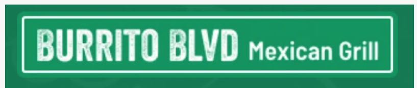
Burrito BLVD -