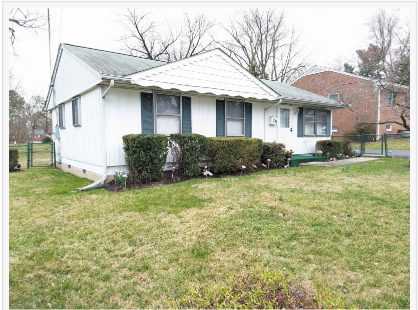
312 Valley View Ave. SW, Leesburg, VA 20175