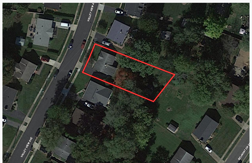
312 Valley View Ave. SW, Leesburg, VA 20175

Craig Damewood Damewood Auctioneers +1 703-303-4760 info@nichollsauction.com