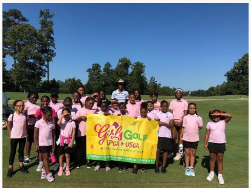
Participants with LPGA*USGA 'Girls Golf' and She STEAMS Foundation