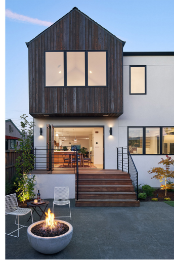
1060 Evelyn Backyard

Attendees of the AIA East Bay Home Tours will enjoy exclusive access to explore every facet of this meticulously crafted home, from the expansive family quarters on the upper level to the welcoming communal areas on the main floor. Throughout the day, the architect and homeowners will be available to provide insights into the design process and share anecdotes about the home's distinctive elements.