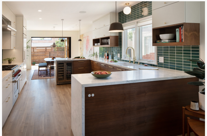
1060 Evelyn Kitchen