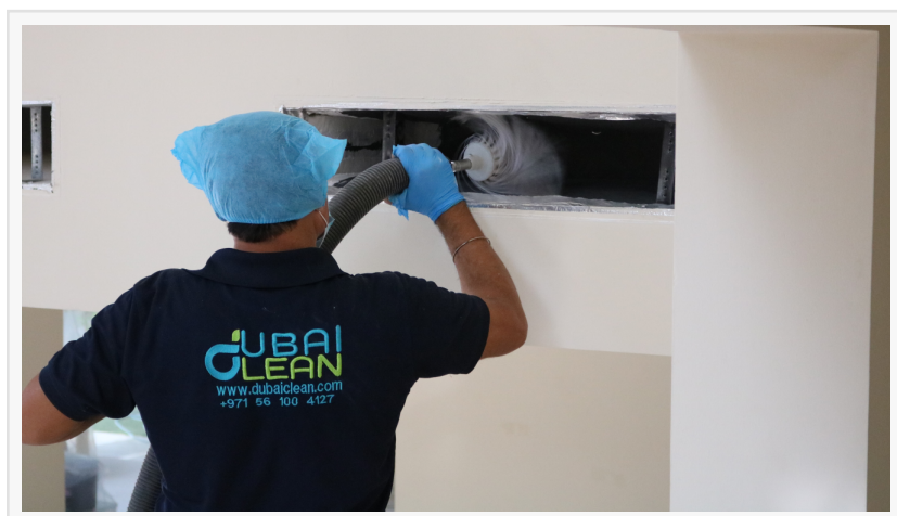
DCS DubaiClean AC Duct Deep Cleaning Services Dubai

DUBAI, UAE, April 3, 2024 /EINPresswire.com/ -- The real estate market in Dubai is currently experiencing a significant surge, with experts predicting continued growth throughout the year. The demand for real estate in Dubai remains robust, as evidenced by the strong double-digit growth in both transaction volume and