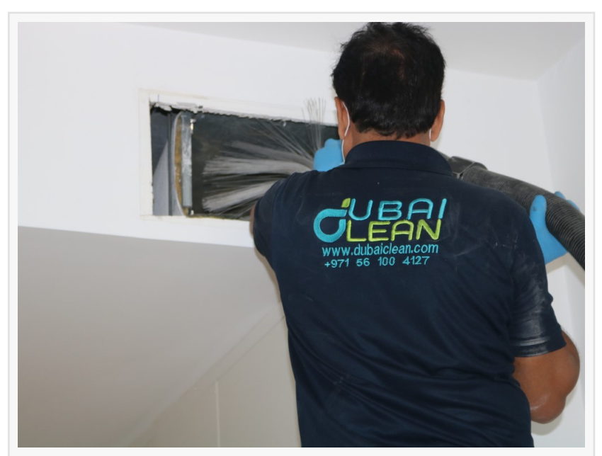
DCS DubaiClean Deep Cleaning Services Dubai

In conclusion, the Dubai real estate market stands out as a beacon of resilience and growth, showcasing a promising outlook with sustained price