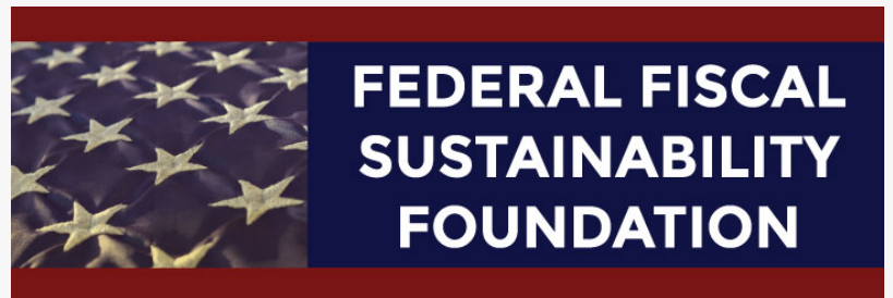
Federal Fiscal Sustainability Foundation