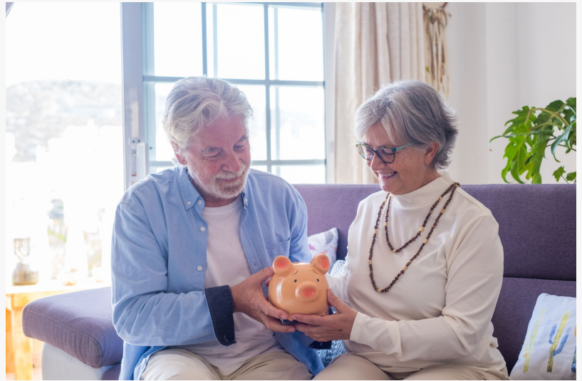
Deposit Waiver Program