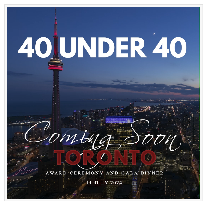
Announcing the 2024 Business Elite's "40 Under 40" Award Ceremony and Gala Dinner in Toronto

The Business Elite Awards are regarded as a source of great recognition within the business community. Being named one of the "40 Under 40" signifies not only exceptional accomplishments but also highlights the immense potential and future impact these individuals have in shaping the Canadian business landscape. The nomination process ensures a rigorous selection, ensuring