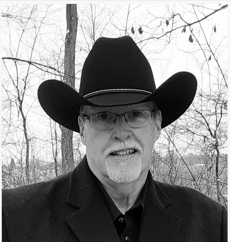
GK Beatty, the author of The Vindicated Man

This press release can be viewed online at: https://www.einpresswire.com/article/701090814