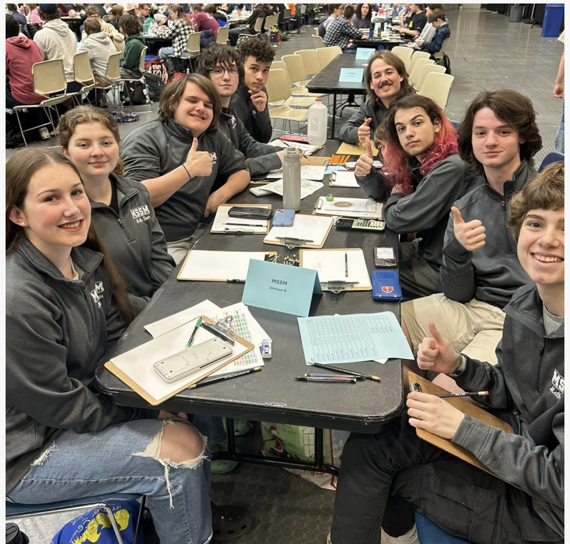
Maine School of Science and Mathematics Math Teams students preparing for the first round.