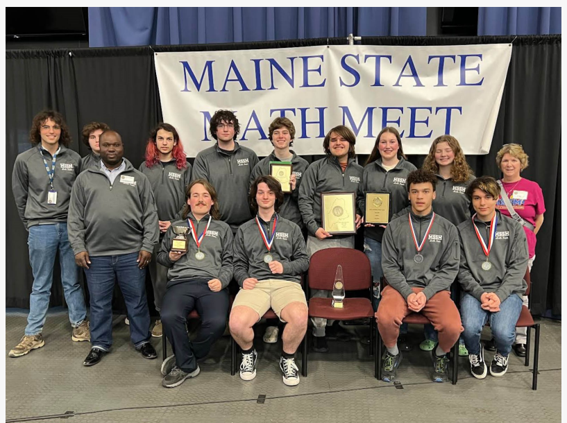
The 2024 Maine School of Science and Mathematics Math Team

LIMESTONE, MAINE, USA, April 4, 2024 /EINPresswire.com/ -- Maine School of Science and Mathematics (MSSM), Maine's only magnet high school and one of the few public boarding schools in the country, earned first place at the 45th Annual Maine State Math Meet at the Augusta Civic Center on April 2, 2024. The Maine State Math Meet brings the top math students from around Maine to competitively demonstrate their understanding of challenging math concepts. After obtaining the highest total score in the state during the five regular math meets, MSSM's Ivory team entered the state meet with high expectations.