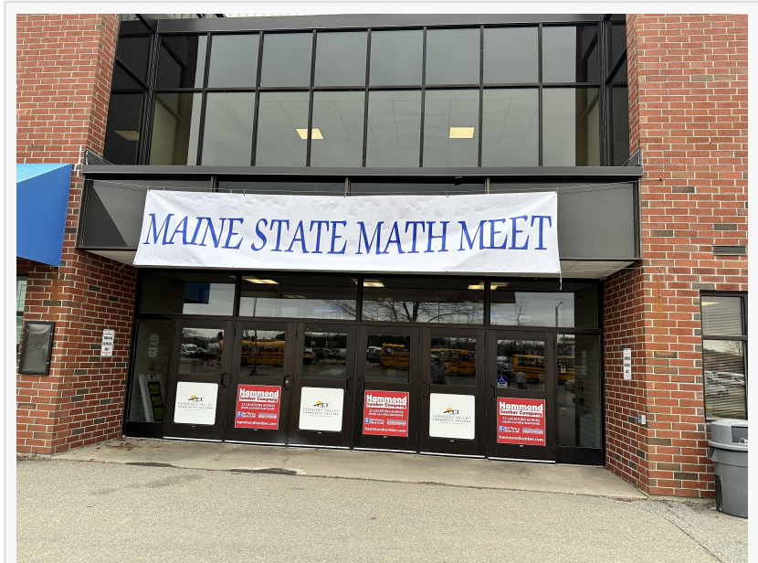
The entrance to the Augusta Civic Center for the 2024 Math Championship

The Maine Association of Math Leagues (MAML) is the organization that sponsors the numerous math competitions and Maine. MAML promotes innovative solutions to difficult problems through analytical thinking and team-based math competitions. Participating schools can send