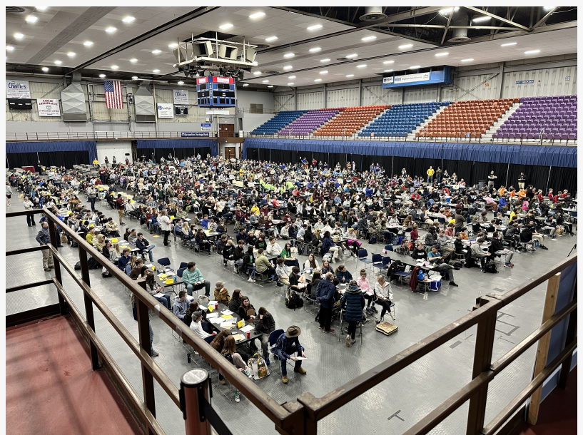
A wide view of hundreds of top Maine student scholars ready to compete in the 2024 Maine State Math Meet.