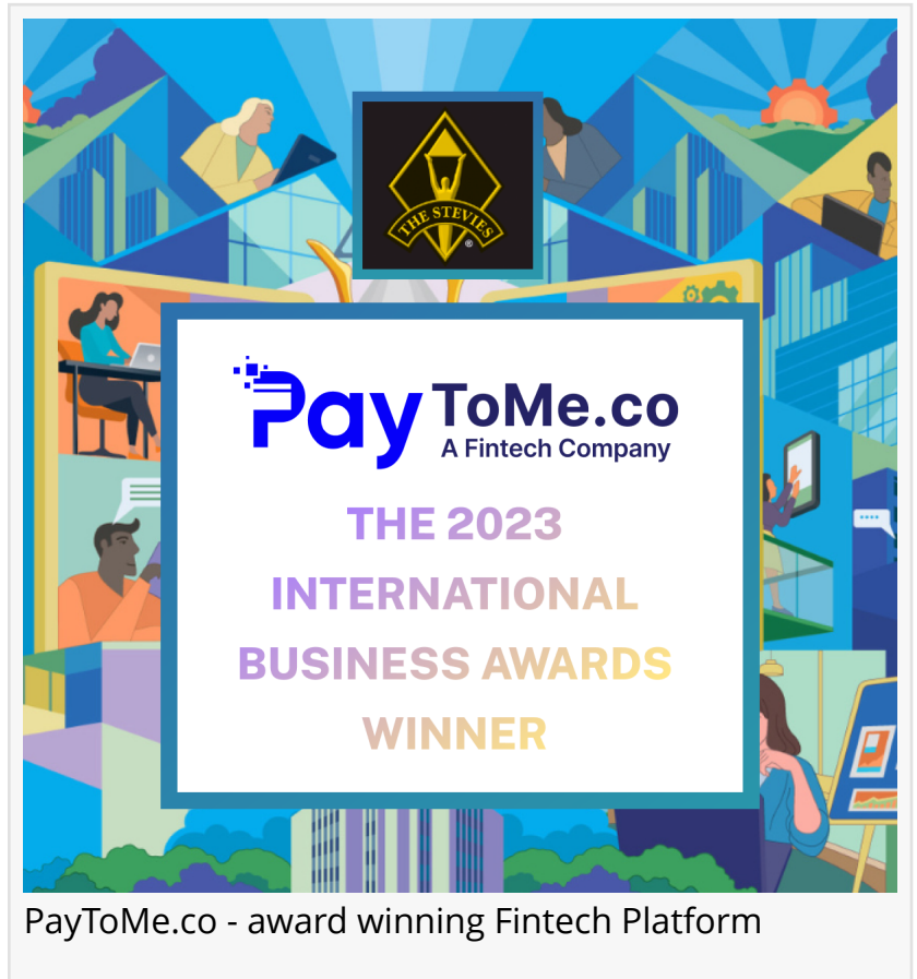
PayToMe.co - award winning Fintech Platform

PALO ALTO, SAN FRANCISCO, USA, April 5, 2024 /EINPresswire.com/ -- In a strategic leap that signifies a monumental shift within the fintech sector, PayToMe.co is proud to announce its recent integration with Stripe Connect. This significant development heralds a new age of enhanced services for platforms and marketplaces, underscoring PayToMe.co's dedication to driving global innovation in the fintech industry. With this move, PayToMe.co aligns itself with the vision and success of leading platforms like Shopify, DoorDash, Lyft, and GitHub, all of which have harnessed the power of Stripe Connect to redefine the realms of Banking-as-a-Service (BaaS) and Software-as-a-Service (SaaS).