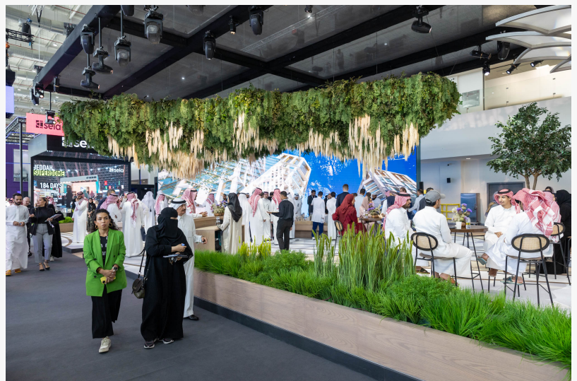
The 2030 Vision is a comprehensive plan for the future of the Kingdom of Saudi Arabia. It outlines the country's goals and aspirations for the next 25 years, covering various sectors including economic, social, and environmental development. The vision aims to transform Saudi Arabia into a modern, diversified economy and a global leader in innovation and technology.