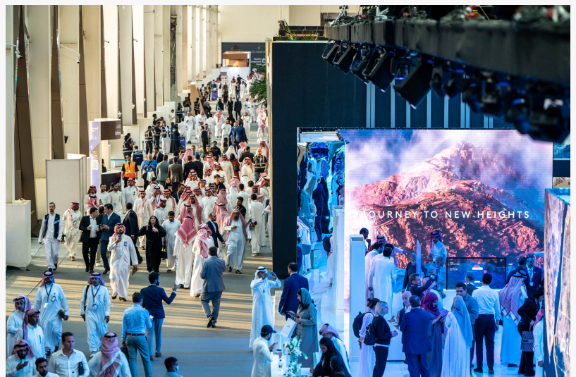
The 2030 Vision is a comprehensive plan for the future of the Kingdom of Saudi Arabia. It outlines the country's goals and aspirations for the next 25 years, covering various sectors including economic, social, and environmental development. The vision aims to transform Saudi Arabia into a modern, diversified economy and a global leader in innovation and technology.