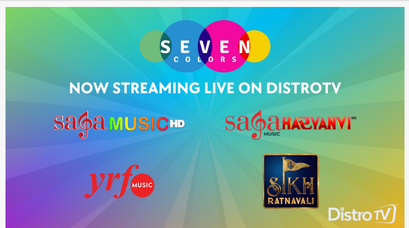
DistroTV + Seven Colors Broadcasting Ltd.