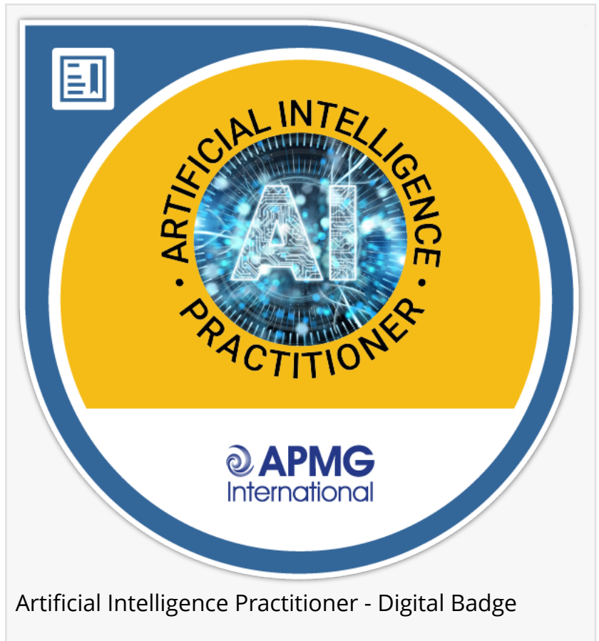
Artificial Intelligence Practitioner - Digital Badge

“The Artificial Intelligence Practitioner (AIP) Certification represents a significant milestone in our