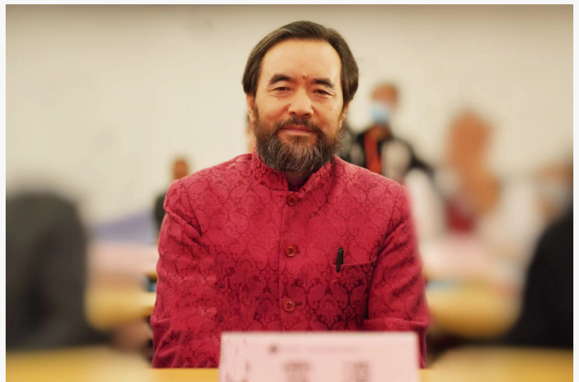
Chinese author Xue Mo

Xue Mo, a prominent figure in Western Chinese literature, gained significant attention at the 2024 London Book Fair while dressed in a red shirt and red-brown hat. His keynote speech, "The Copyright Value of Xue Mo's Works," highlighted his journey to international acclaim and explored the essential role of literature and the publishing industry in enriching the spiritual lives of individuals and advancing world peace.