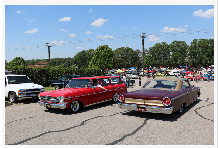
Join the cruising fun of the Goodguys North Carolina Nationals in Raleigh, North Carolina, April 19-21.

be on hand to select the Top 10 Builders Choice rides of the weekend and on Sunday, the gates