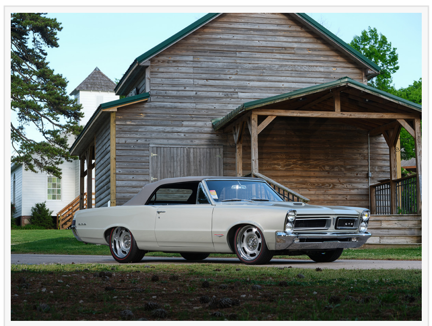
See thousands of classic trucks, hot rods and muscle cars like this 1965 GTO at the Goodguys North Carolina Nationals, April 19-21, in Raleigh.

More racing excitement takes place as the Goodguys CPP Autocross racing series returns to Raleigh where drivers race around corners and dodge cones each day with hopes to qualify for the No Limit Engineering "Rumble in Raleigh" AutoCross Shootout on Saturday afternoon. The racing continues on Sunday with the Meguair's All American Sunday AutoCross Shootout.