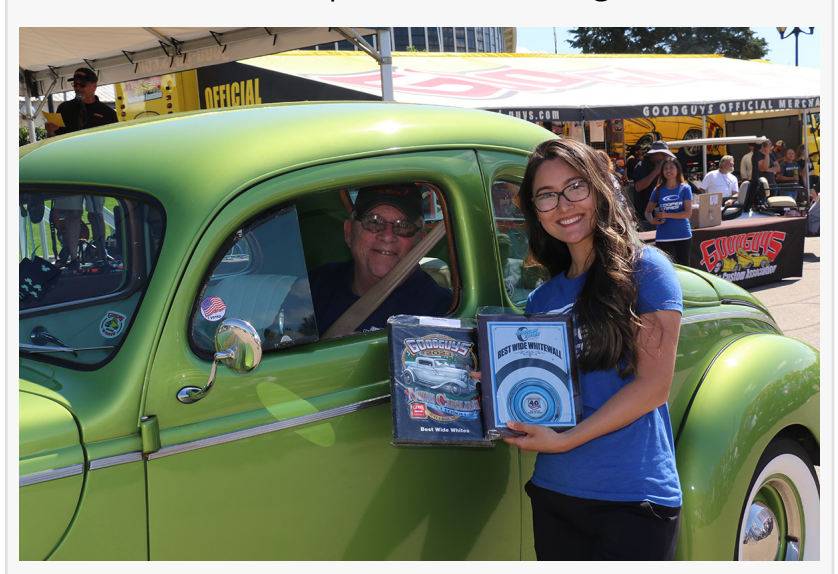
There are plenty of unique, fun awards given away at the Goodguys Nationals in Raleigh, North Carolina, April 19-21.

Saturday evening brings an an action-packed and metal-crunching Demolition Derby where competitors will beat, bounce and crash into each other on a slippery, red clay surface battling to be the last car running (extra ticket required).