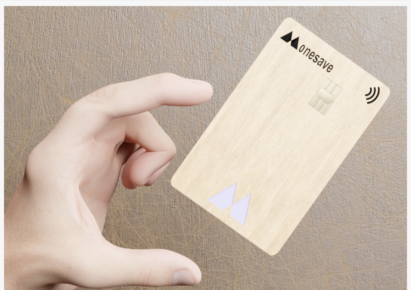
Monesave Wooden Debit Card

Most Banking and Fintech app's today focus on personal finance and personal budgets. Monesave aims to focus more on the social approach while also allows users to anonymously