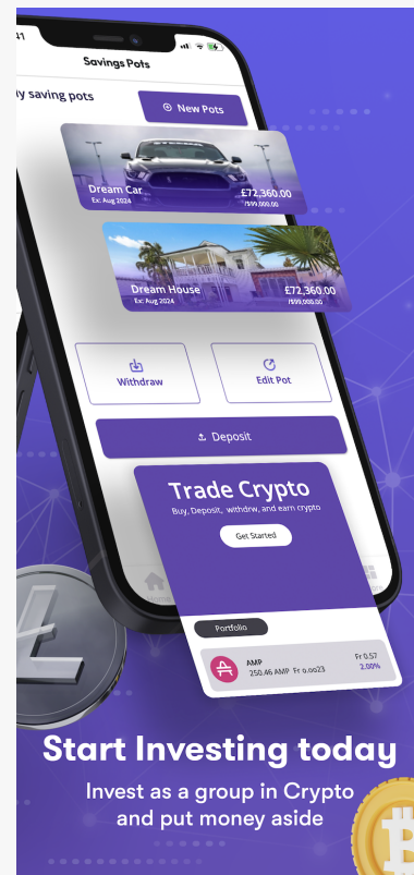
Trade Crypto with Monesave