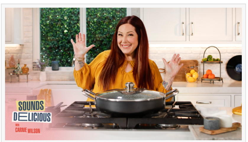
Sounds Delicious with Carnie Wilson premieres Tuesday April 16 on AXS TV

LOS ANGELES, CA, USA, April 9, 2024 /EINPresswire.com/ -- This spring, <u>AXS</u> <u>TV</u> turns up the heat with the original cooking series "<u>Sounds Delicious with</u> <u>Carnie Wilson</u>." Premiering Tuesday April 16, 2024 at 8:30 PM ET, this marks the first time the network has entered into the culinary show domain.