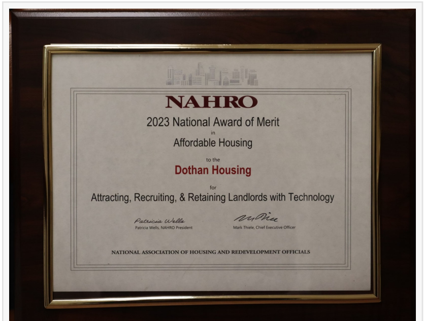
2023 NAHRO Merit Award for Improving Relationships with Section 8 Landlords through Technology