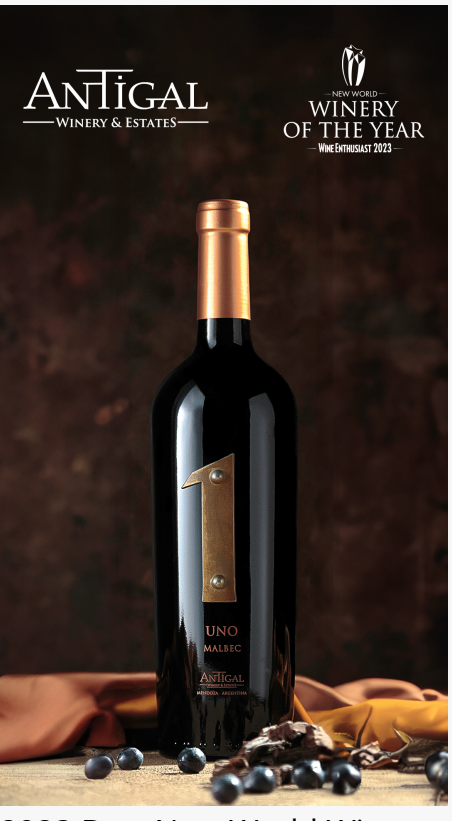
2023 Best New World Winery of the Year

This press release can be viewed online at: https://www.einpresswire.com/article/701930116